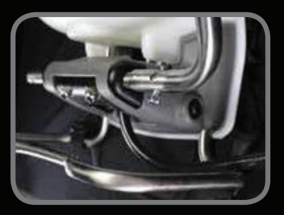
Threaded Connection Points with pump handle to produce efficiency and strength.