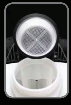
Dual Filtration to prevent clogging.