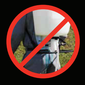
Internal Pump prevents liquids from leaking down users back.